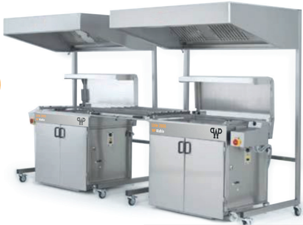
The extractor hoods shown are optionally available.